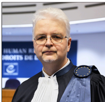
MYKOLA GNATOVSKY JUDGE: EUROPEAN COURT OF HUMAN RIGHTS