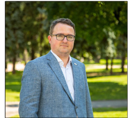
ANTON KORYNEVYCH AMBASSADOR: MINISTRY OF FOREIGN AFFAIRS OF UKRAINE